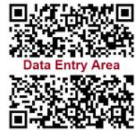
Data Entry Area

Beginning on August 1st https://fm.cycu.edu.tw/