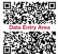
Data Entry Area

Beginning on April 7th https://fm.cycu.edu.tw/