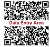
Data Entry Area

Beginning on August 1st https://fm.cycu.edu.tw/