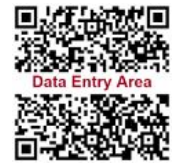
Data Entry Area

Beginning on August 1st https://fm.cycu.edu.tw/