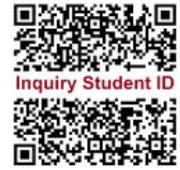
Inquiry Student ID

Please scan the QR Code on the right for the student ID or more information.